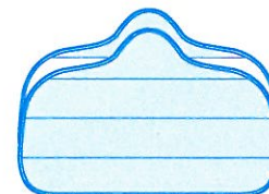
microfiber pads (2)

©2011 Vornado Air LLC, Andover, Kansas 67002 USA